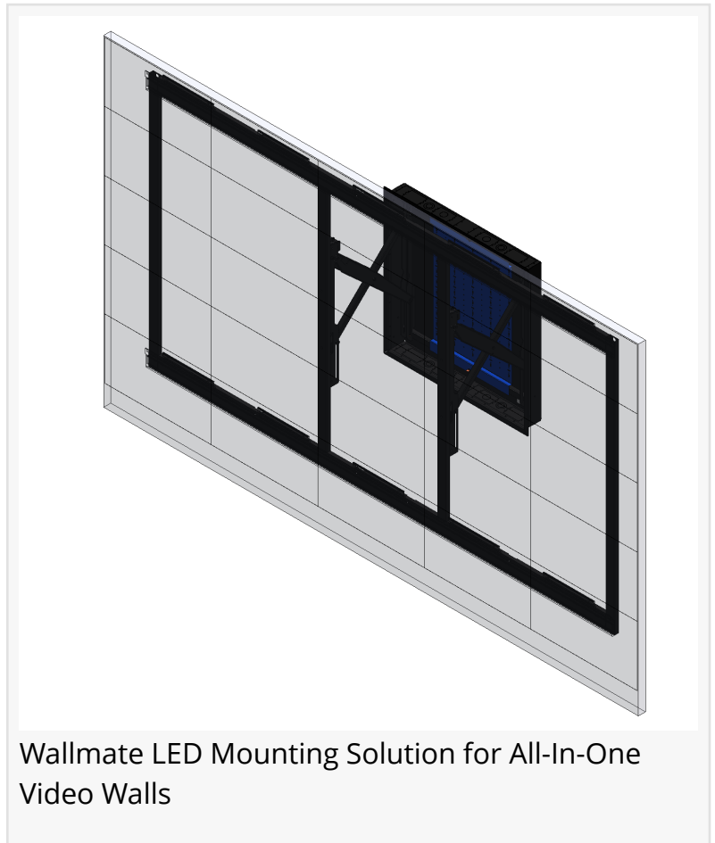
Wallmate LED Mounting Solution for All-In-One Video Walls