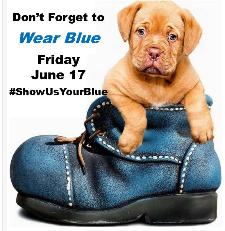
Wear Blue for Men Puppy June 17

Inc. "The impact of COVID has had a devastating effect on so many aspects of health, including comprehensive male health."