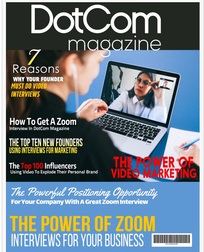
The Power Of Zoom Interview Issue