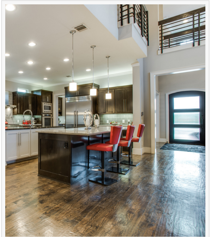
NorthStar Luxury Home on Wafflemat Foundation System

This press release can be viewed online at: https://www.einpresswire.com/article/574919187