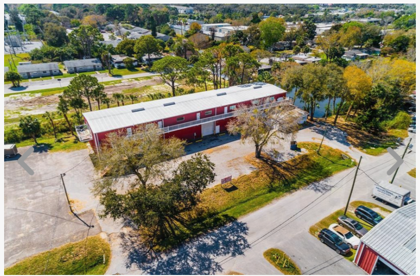
$GTVH subsidiary HyFrontier Technologies

On May 31st GTVH announced preliminary details of the first three contracts it has executed for installment of the Electryone Drive green energy technology. Over the past several months, GTVH has been working diligently to acquire new clients to deploy the Electryone Drive. GTVH reports initial executed contracts in three separate locations in the state of California, will generate a total of 14.7 megawatts of green energy.