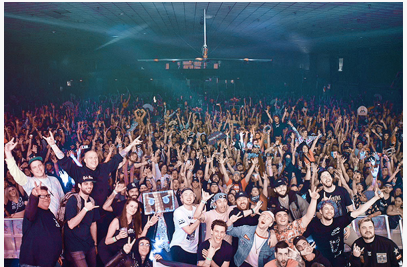
$GTVH Entertainment Show