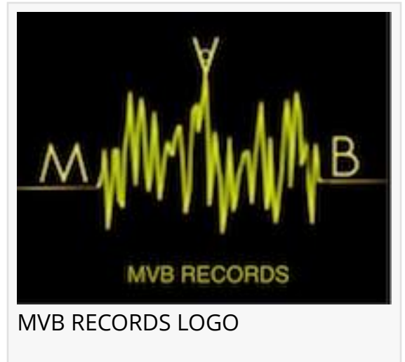
MVB RECORDS LOGO

This press release can be viewed online at: https://www.einpresswire.com/article/575060617