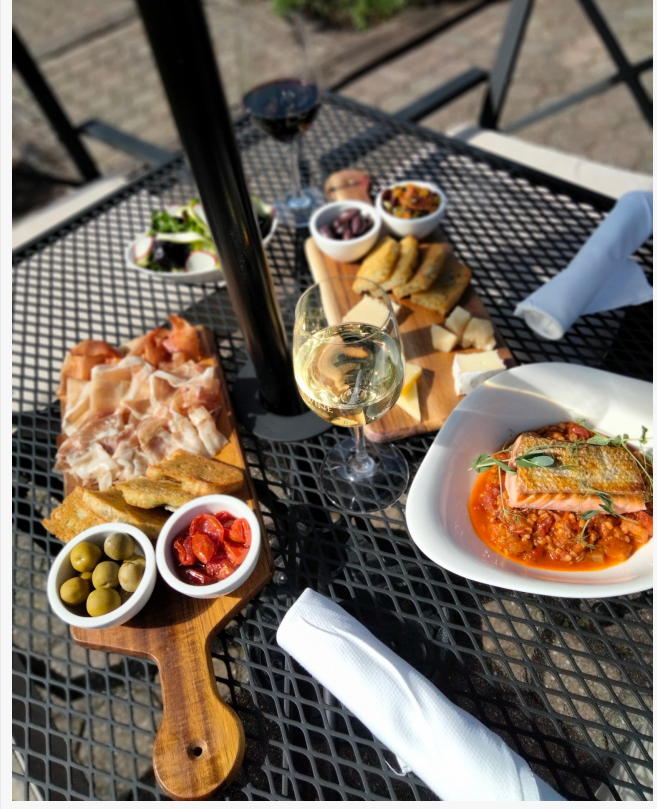
Drink and dine al fresco at the Cree Wine Company.

SUMMER WALK AROUND WINE TASTING Saturday, June 11 167 Perryville Rd., Hampton, N.J. 1 p.m. $65 per person plus tax and gratuity Reservations recommended