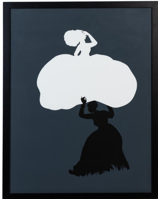
Screenprint on paper by Kara Walker (N.Y., b. 1969), titled The Emancipation Approximation, Scene 18 (2000), 44 inches by 34 inches (sight) (est. $10,000-$15,000).

The screenprint on paper by Kara Walker (N.Y., b. 1969), titled The Emancipation Approximation,