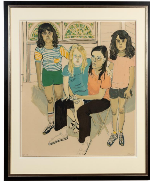
Color lithograph on paper by Alice Neel (American, 1900-1984), titled The Family , editioned "76/175" lower left, signed and dated lower right (est. $3,000-$6,000).

Another Session 2 standout lot is the pair of Art Deco "Goddess of Speed" carved stone architectural panels, originally intended for Packard Motor Car Company (American, 1899-1958) dealerships, and applied to their facades. The 25 ½ inch by 52 ½ inch panels are expected to hit $6,000-$8,000. The "Goddess of Speed" automobile hood ornament was modeled after the