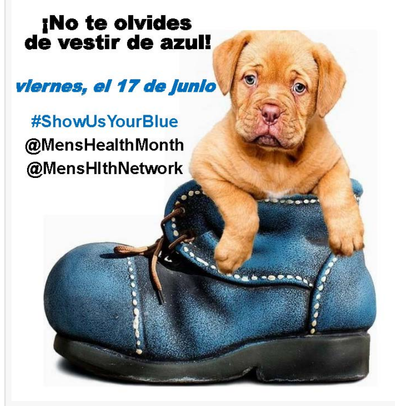
Wear Blue for Men's Health Puppy June 17 Spanish