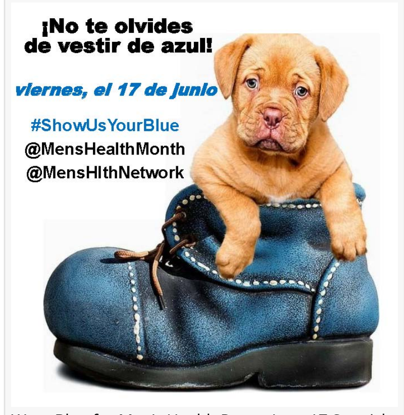
Wear Blue for Men's Health Puppy June 17 Spanish