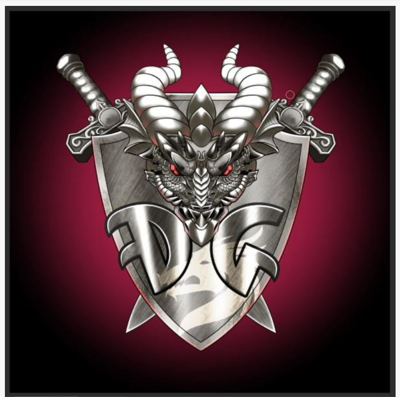
The Guild must come First

but also will do it at a cheaper price than was initially