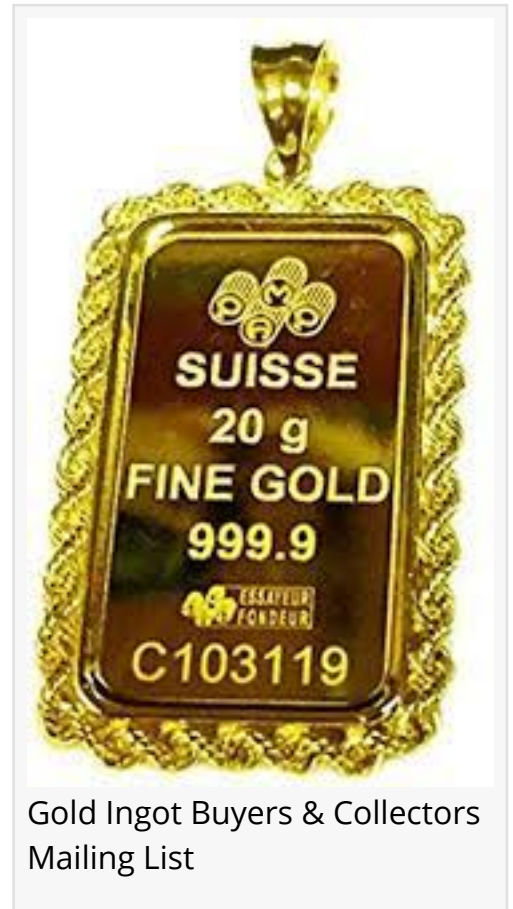
Gold Ingot Buyers & Collectors Mailing List

Sprint Data Solutions Worldwide Marketing chose direct mail as its entry point into the marketing sector. At the time, traditional, "analog" marketing techniques like television and print advertising were still the dominant forces, but digital marketing, despite being new, was already showing a lot of potentials. Working in direct mail proved a fortuitous decision, as it imparted