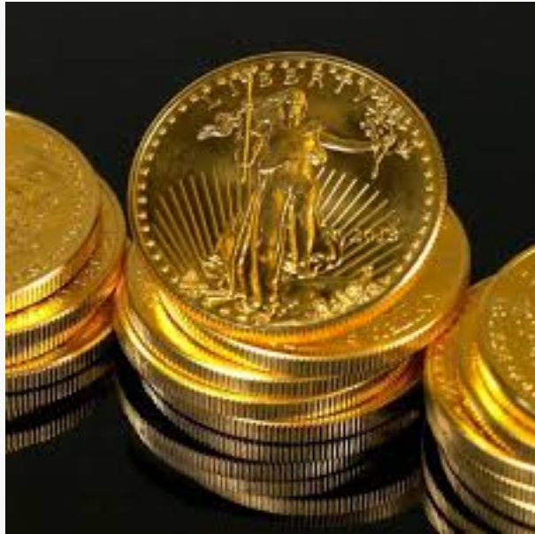
Rare Collectable Gold Coin Buyers Mailing List

If you're interested in marijuana dispensary and head shop owners lists , contact Sprint Data