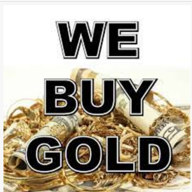
Gold Sellers & Buyers Mailing List

The result of this is that some states still maintain marijuana as an illegal substance, while others have declared it legal for medical usage. Still, other states have gone as far as Canada and said it is legal for recreational use, but with similar restrictions to alcohol or tobacco products. This has created a vast range of different marijuana products, such as the now rapidly emerging market of CBD—a derivative of cannabis, for pain, anxiety, and even depression management. On the other hand, organic marijuana and even THC products, the marijuana derivative responsible for psychotropic properties, are sold recreationally as edibles, extracts, and associated accessories. The marijuana dispensary and head shop market in the United States is in infancy, meaning everything from financial services to construction benefits as the industry grows.