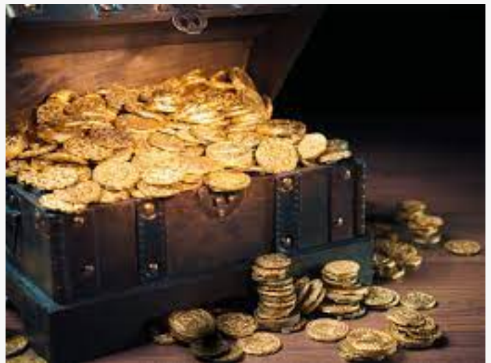
Gold Coin Buyers Mailing List