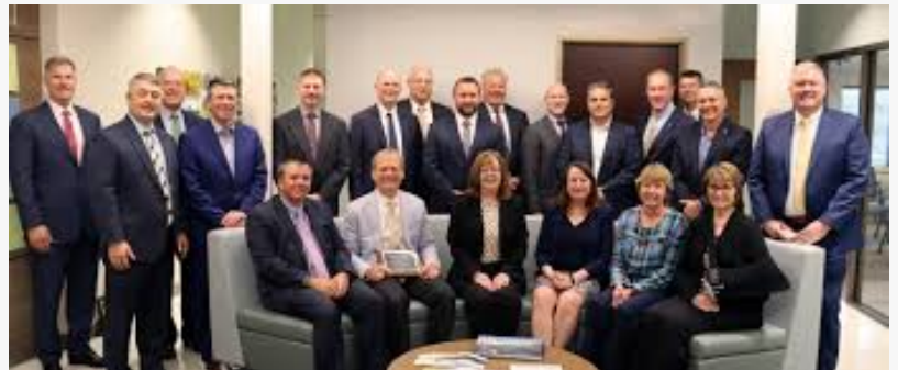
America's TOP Bankers at Home Mailing List