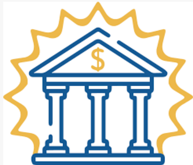
America Banks Business Mailing List