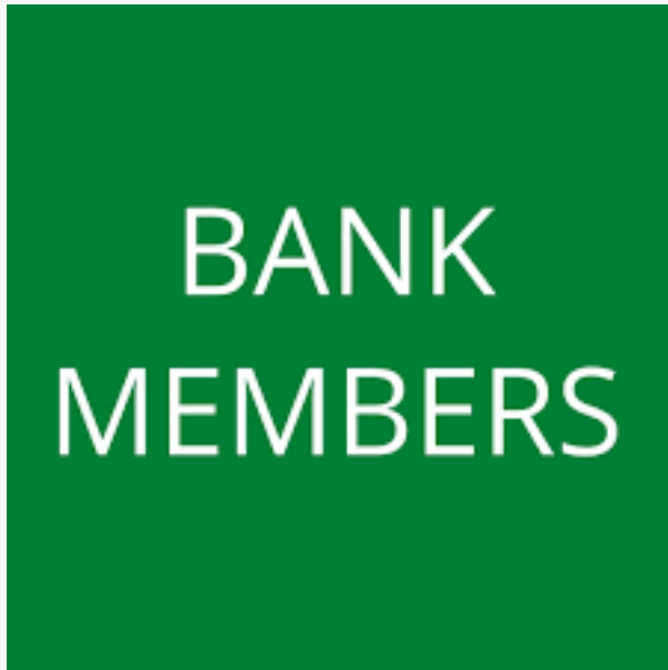
State Bank Association Members Mailing List

This became especially important as bank branches interacted more and more with each other. Once other means of transactions besides in-person and paper documentation, banking activities became incorporated into the range of services. Today, the ABA serves small local, medium regional, and even large national banking groups, providing consultation, research data, and providing a focused voice for the concerns of the banking sector when it comes to having their interests and concerns heard and addressed at the government level. This is a concerted group with many individual members and