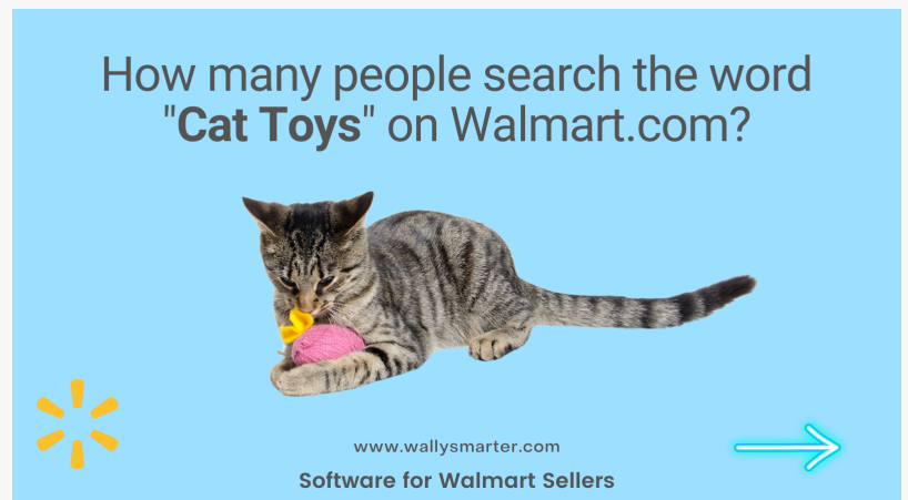
Wallysmarter.com makes Walmart Keyword Research Easy