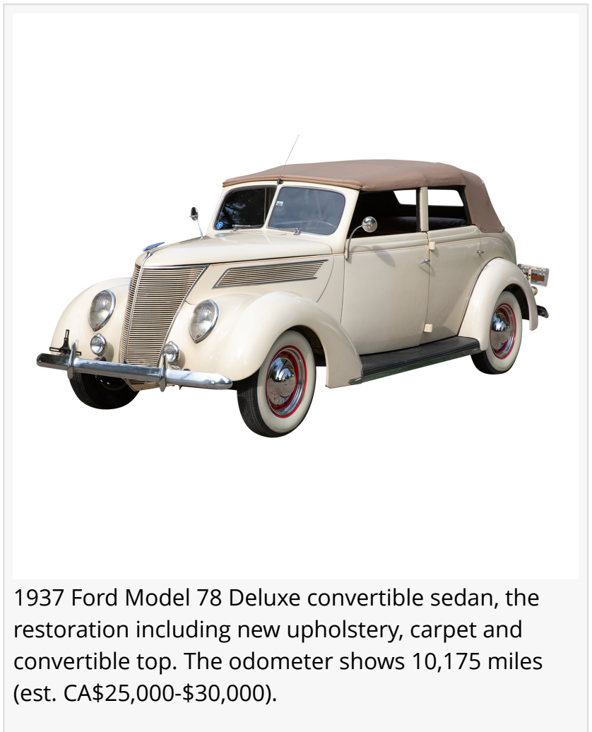
1937 Ford Model 78 Deluxe convertible sedan, the restoration including new upholstery, carpet and convertible top. The odometer shows 10,175 miles (est. CA$25,000-$30,000).

Miller & Miller Auctions, Ltd. is Canada's trusted seller of high-value collections and is always accepting quality consignments. The firm specializes in watches and jewelry, art, antiques and