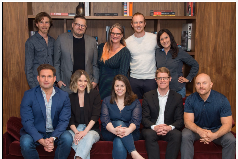
BLOCKS, DAO LLC team at the Advancements with Ted Danson shoot