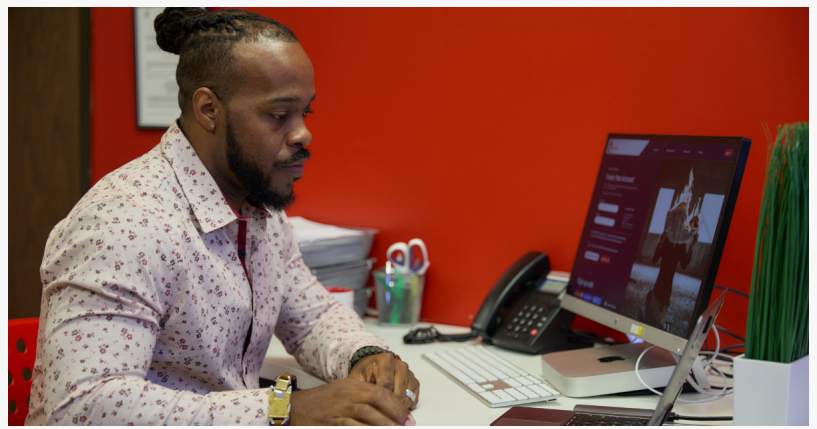
In-house UX and UI Designers

Boral Agency is a full-service digital marketing agency based in Houston, Texas. They serve clients in the Houston area and across the globe, and they expect their reach to expand even further with the advent of their new UX/UI app and software design services.