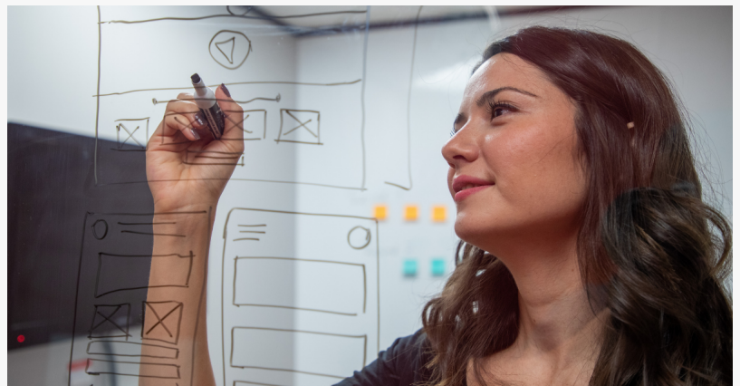
Boral Agency - Digital Marketing

HOUSTON, TEXAS, UNITED STATES, June 10, 2022 /EINPresswire.com/ -- Boral Agency is thrilled to announce that they are now officially offering a new service: UX/UI app and software design.