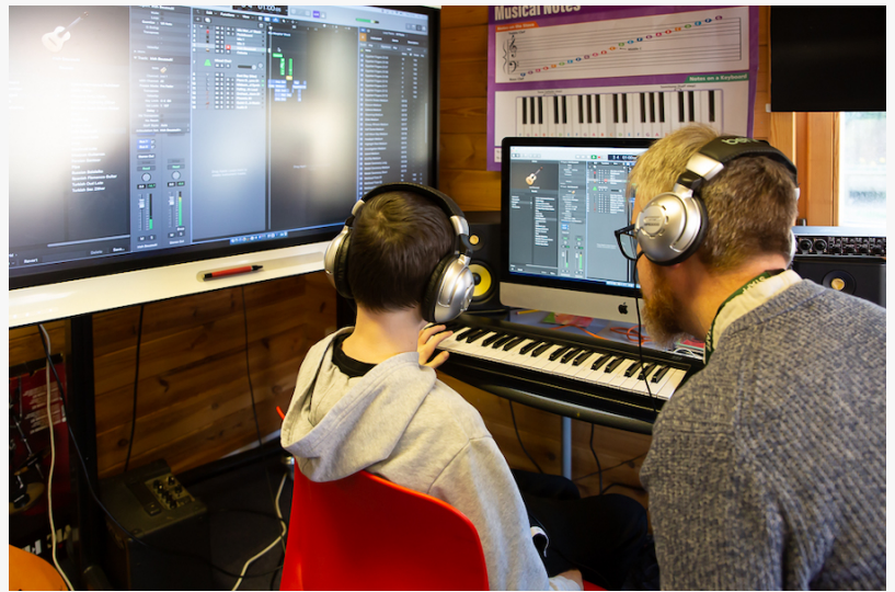
Undershaw student engaging with music technology