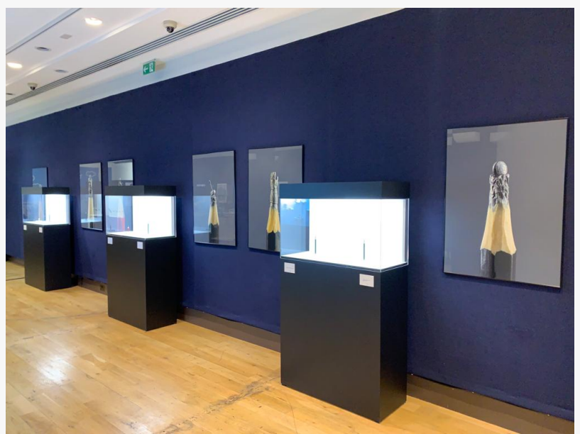
Jasenko Dordevic Miniature Sculpture Exhibition

This press release can be viewed online at: https://www.einpresswire.com/article/575415946