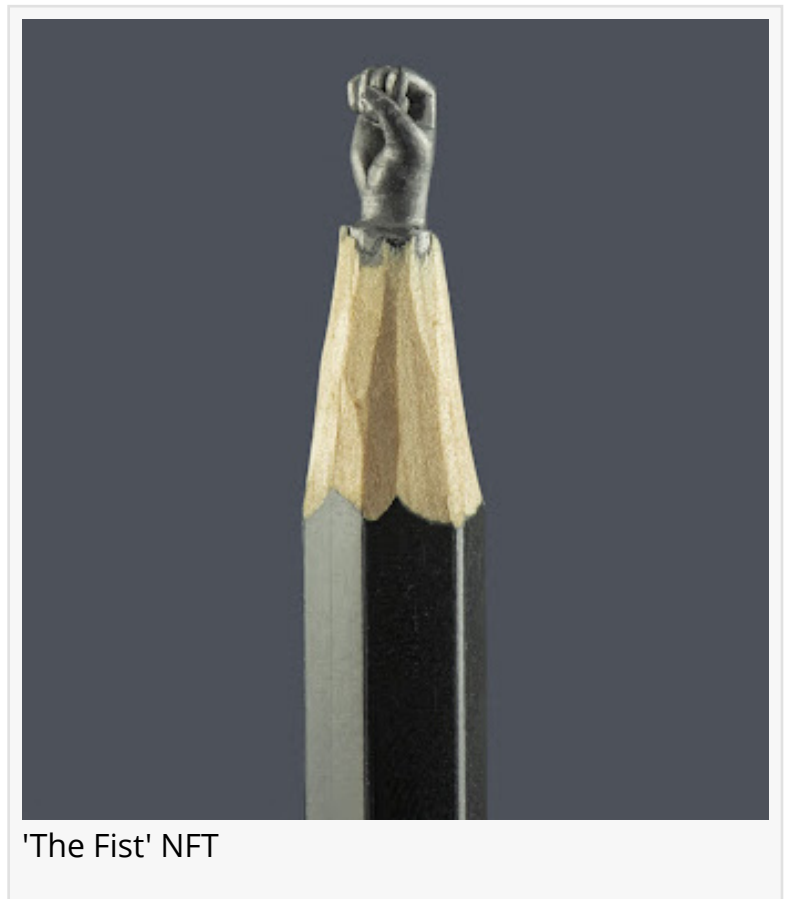
'The Fist' NFT