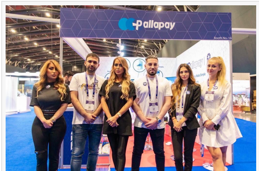
sell usdt in dubai

Bitcoin was created as a way for people to send money over the internet. The digital currency was intended to provide an alternative payment system that would operate free of central control but otherwise be used just like traditional currencies.