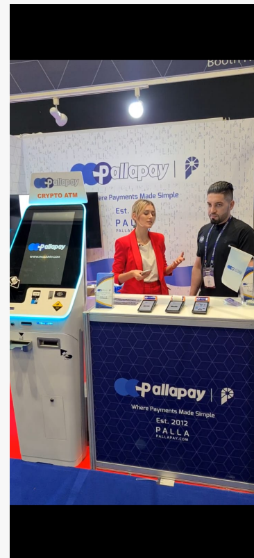
sell bitcoin in dubai