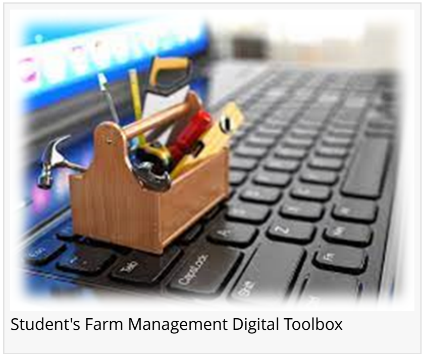
Student's Farm Management Digital Toolbox

Each year many farmers wrestle with planting decisions. “These are literally bet the farm calls. Practically speaking planting decisions are pretty much irreversible. Selecting a crop mix is a complex set of inter-related decisions that many farmers approach serially because that’s how we’re taught to deal with complexity. Break it down.”