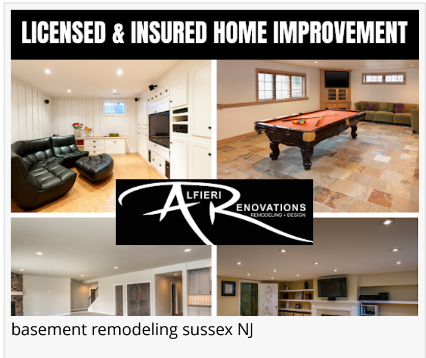
basement remodeling sussex NJ