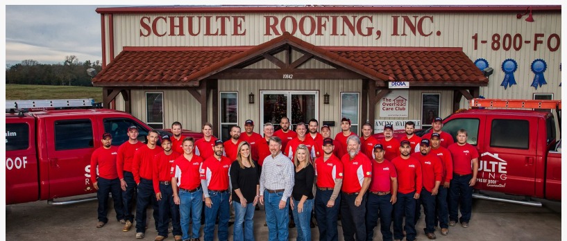
A full team photo of Schulte Roofing