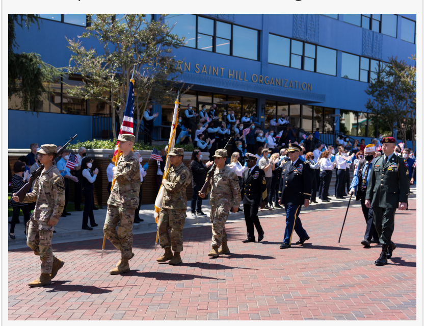
Mid-afternoon was a Memorial Day parade to honor those fallen in battle.