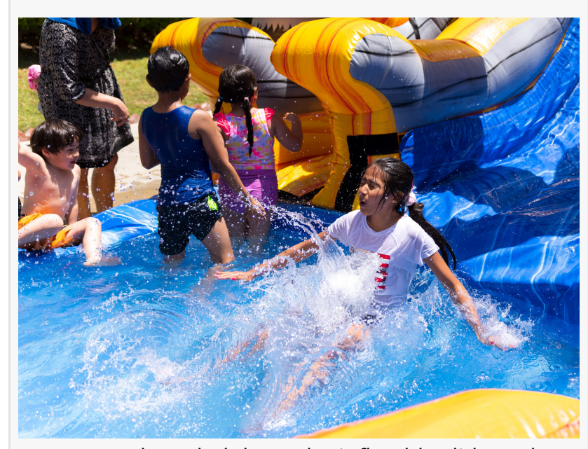
Youngsters barreled down the inflatable slide and into the water, and the younger set splashed in the wading pool set up on L. Ron Hubbard Way.