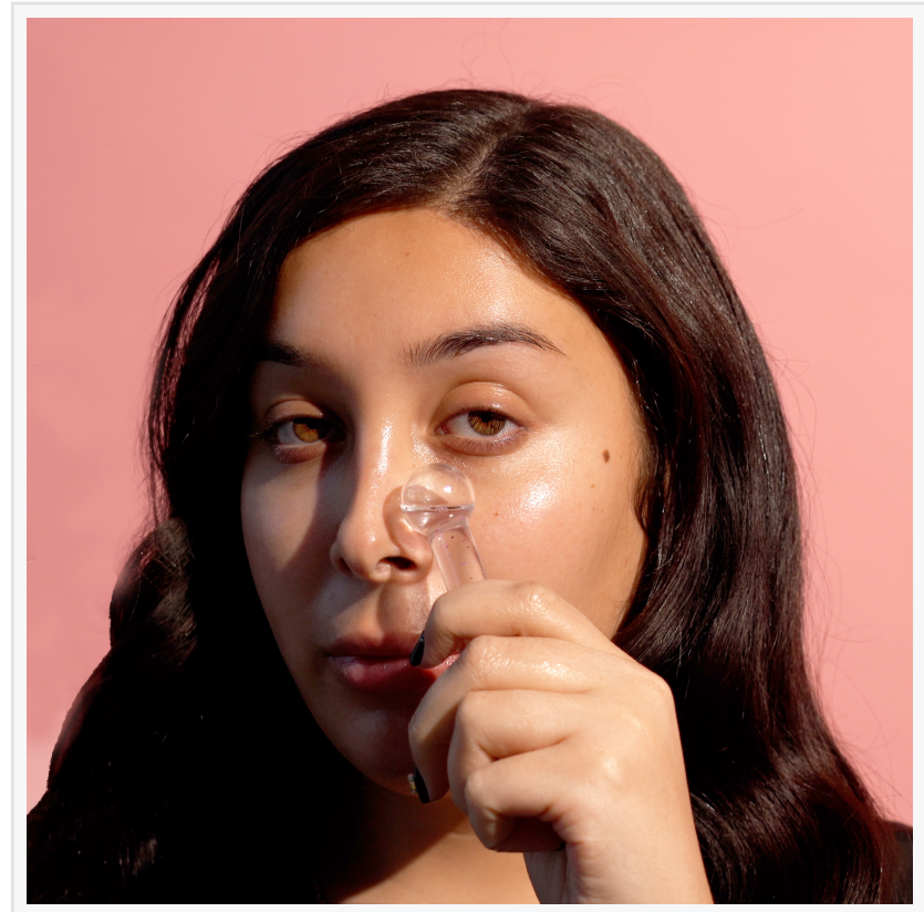
Lymphatic Self Massage using Baby Frioz Facial Globes

About SONAGE: Sonage advocates a holistic lifestyle, curating routines for that familiar spa feeling - leaving your skin glowing and your mind calm. The New Natural at Sonage balances compelling, research-based science