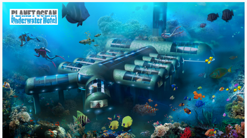
Planet Ocean Underwater Hotels

"The UAE is taking the lead in funding this exciting 50/50 raffle," said the Managing Director of