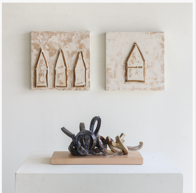
Artwork "Neighbors" and "Home" hung on the wall above ceramic work "Smokey"