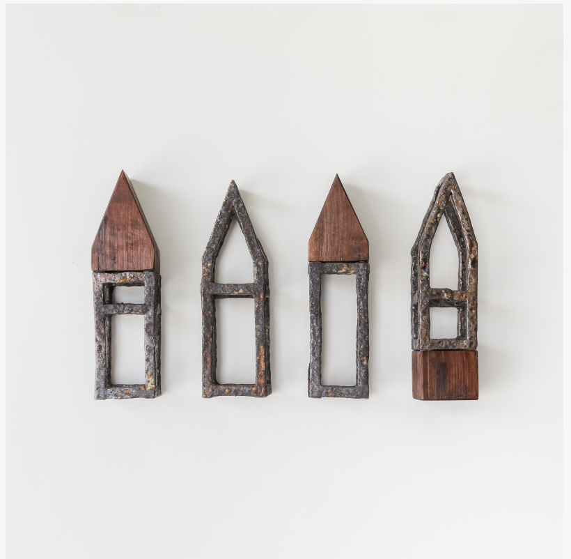
"Westward Expanse" made of glazed stoneware and walnut wood