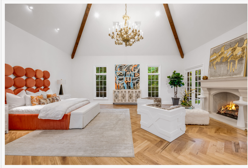
Breathtakingly appointed interiors with seven bedroom suites

Preston Hollow, known as the "golden corridor of Dallas," boasts some of the city's most affluent residents and most expensive estate homes. Close proximity to top private schools keep Preston Hollow a hot commodity. Highend shops and trendy restaurants round out this stretch of Northern Dallas. Preston Center, NorthPark Mall, and the Galleria offer a trifecta of shopping. Easy access to the Dallas North Tollway and Northwest Highway