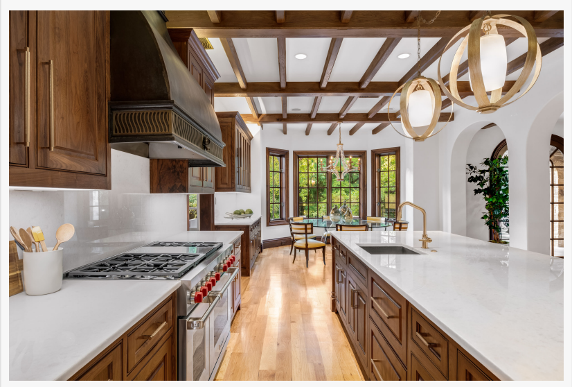
Grand gated estate with next-door lot

make the whole of Dallas convenient to reach by car. Dallas' Downtown is within minutes of your front door, a bustling and ever-growing business sector that's bursting with museums and experiences to enjoy. Venturing beyond city limits is a breeze via DFW International Airport, only twenty minutes away.