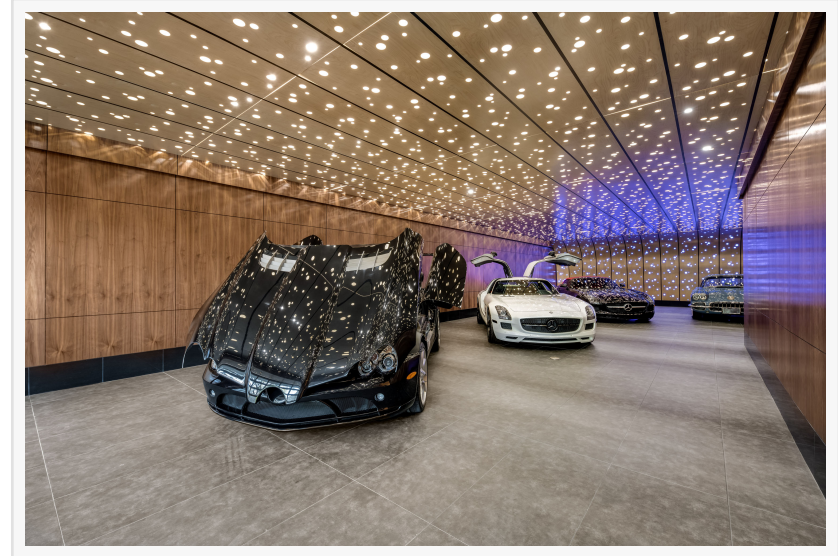
3.194 acres ideally located in prestigious Preston Hollow

Sotheby's Concierge Auctions is the world's largest luxury real estate auction marketplace, with a state-ofthe-art digital marketing, property preview, and bidding platform. The firm matches sellers of one-of-a-kind homes with some of the most capable property connoisseurs on the planet. Sellers gain unmatched reach, speed, and certainty. Buyers receive curated opportunities. Agents earn their commission in 30 days. In November 2021, the firm was acquired by Sotheby's, the world's premier destination for fine art and luxury goods, and Realogy Holdings Corp., the largest full-service residential real estate services company in the United States, holding a joint 80 percent ownership stake. Sotheby's Concierge Auctions continues to operate independently, partnering with real estate agents affiliated with many of the industry's leading brokerages to host luxury auctions for clients. Since Sotheby's Concierge Auctions' inception in 2008, it has generated billions of dollars in sales, broken