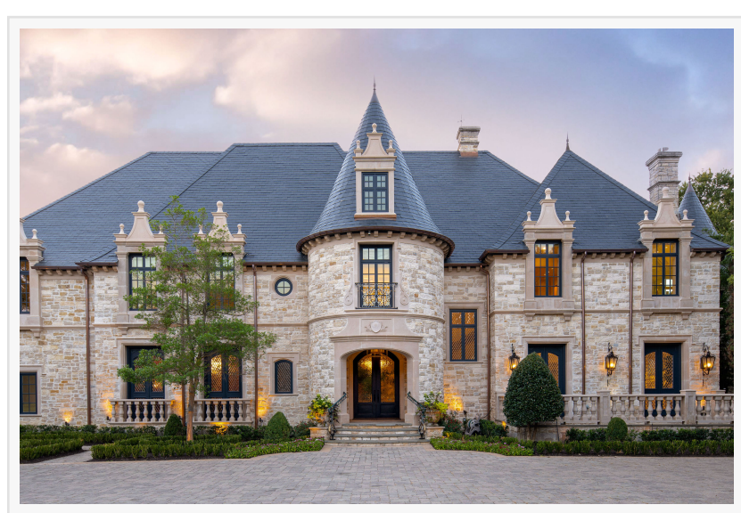
9727 & 9715 Audubon Place | Dallas, TX

NEW YORK, NEW YORK, UNITED STATES, June 8, 2022 /EINPresswire.com/ -- Opulence awaits at 9727 & 9715 Audubon Place, where a stunning, beautifully renovated, seven bedroom gated estate and neighboring buildable lot totalling 3+ acres beacon from Old Preston Hollow in Dallas, Texas. The 3+ acre-property offering will auction in July via