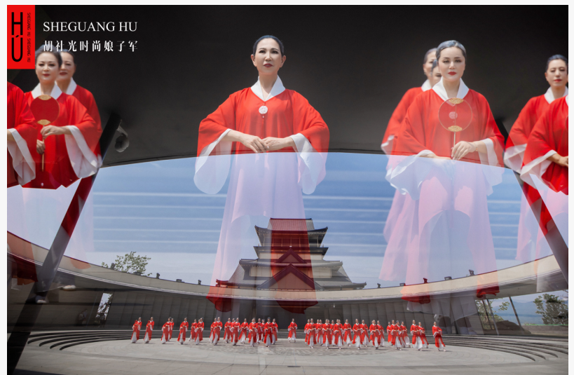
Hu Sheguang Fashion Women's Army at Sunac A'Duo Town