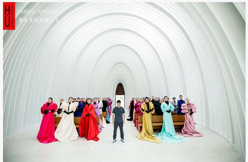
Hu Sheguang Fashion Women's Army