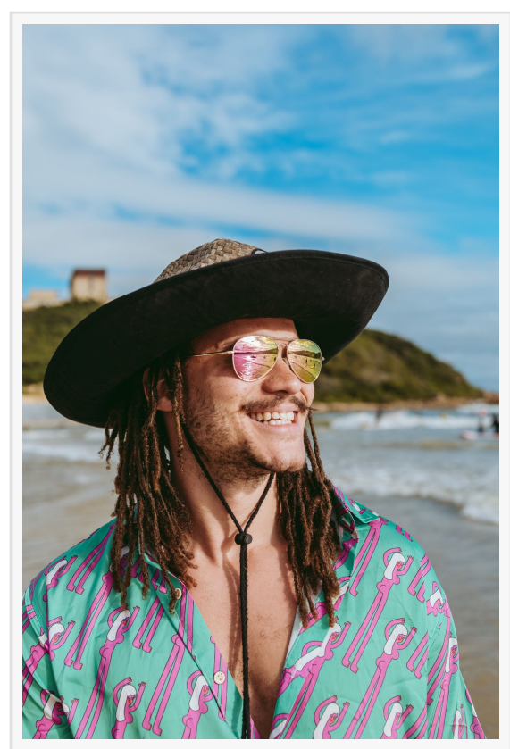
Black Shades "Vacation Lifestyle" Sunglasses

In a recent report from the International Union of Conservation, "At least 14 million tons of plastic end up in the ocean every year, and plastic makes up 80% of all marine debris found from surface waters to deep-sea sediments." All of J. Vaughn's sunglasses are made from