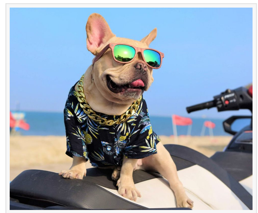
Black Shades "Good Vibes and Clean Tides"