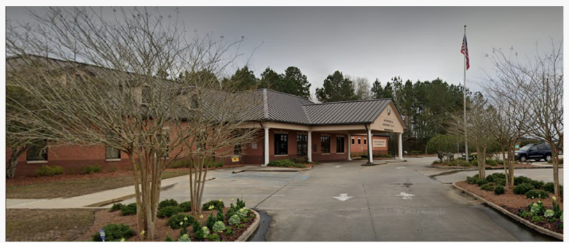
Hattiesburg GI Associates, 100 Methodist Blvd, Hattiesburg, MS 39402

This press release can be viewed online at: https://www.einpresswire.com/article/575926061