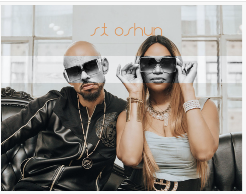
St Oshun: C-Dub & Porsche

With a goal of reaching music lovers all over the globe, St Oshun's plans to connect a tribe of millions of music lovers through feel-good vibes. These vibes come courtesy of relatable pop music, directly influenced by the classics. After visiting any of their live shows, music fan quickly appreciate how they've gained the confidence necessary to have such an aggressive mission statement. On Friday June 10th, the remix to their hot single "Spotlight" drops on all platforms.