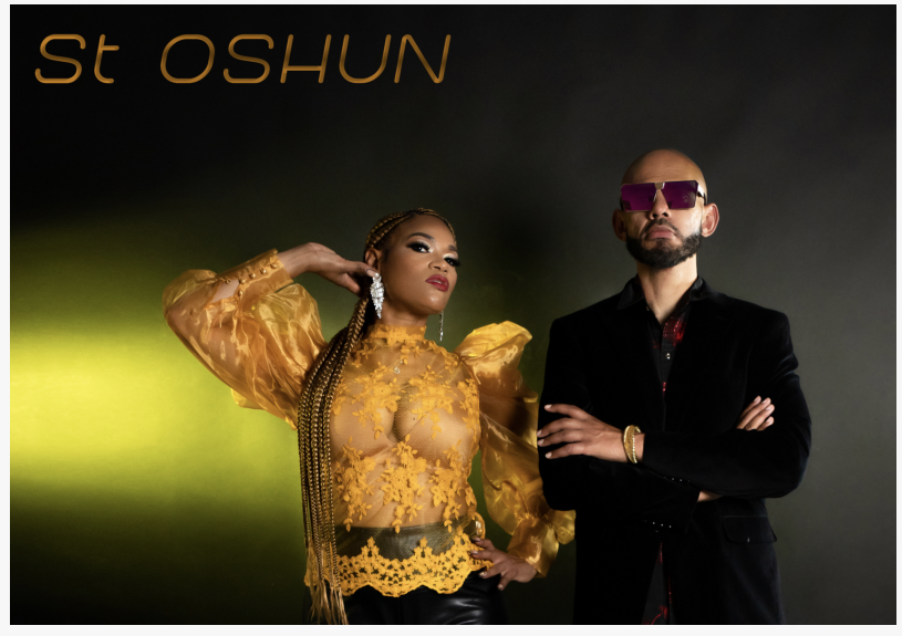
St Oshun: Porsche & C-Dub