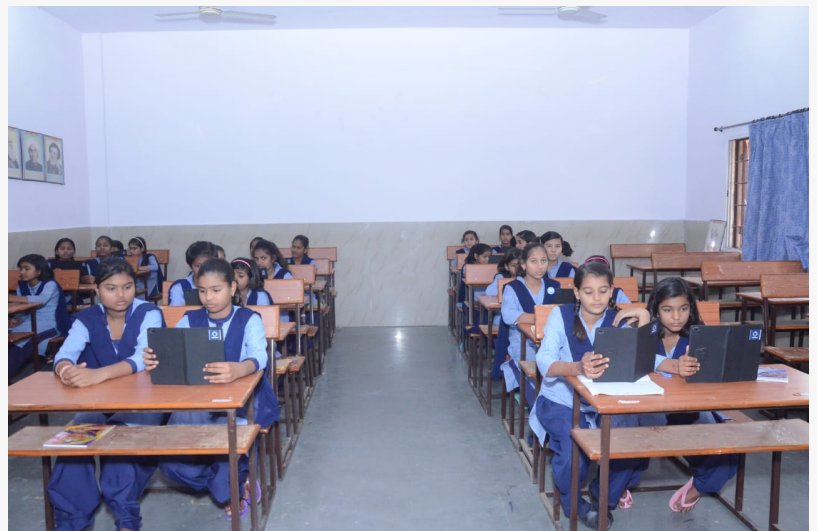
Girl Students using Tabs provided by Ashraya at a school in Madhya Pradesh.

This press release can be viewed online at: https://www.einpresswire.com/article/576042350