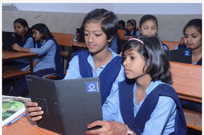
Screen is our window to the world of knowledge.

NEW DELHI, DELHI, INDIA, June 9, 2022 /EINPresswire.com/ -- Ashraya has launched a program to help students to learn to their potential with the help of technologies provided by Edufront . In its first program it has planned to invest Rs 5 crores (roughly $670,000) over the next 5 years at Adarsh Vidya Mandir, Ambawadi, Jaipur.