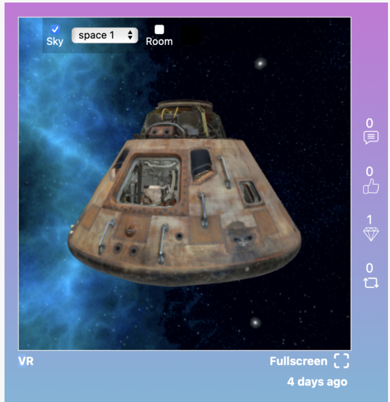
NFTz 3D NFT