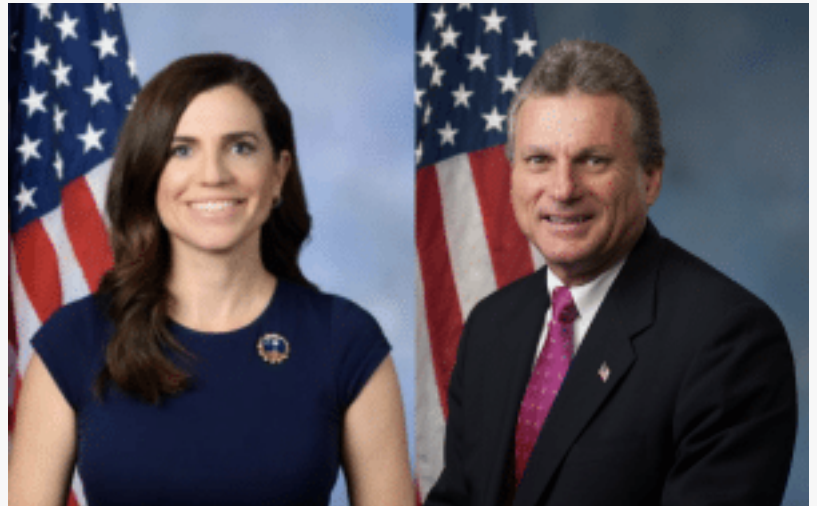
Left: U.S. Rep. Nancy Mace, R-S.C. | Right: U.S. Rep. Buddy Carter, R-Ga.