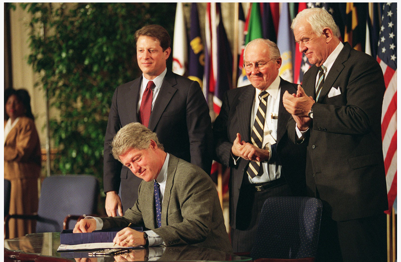
Clinton signs NAFTA law . Dec. 8.1993. made possible by Internet 2