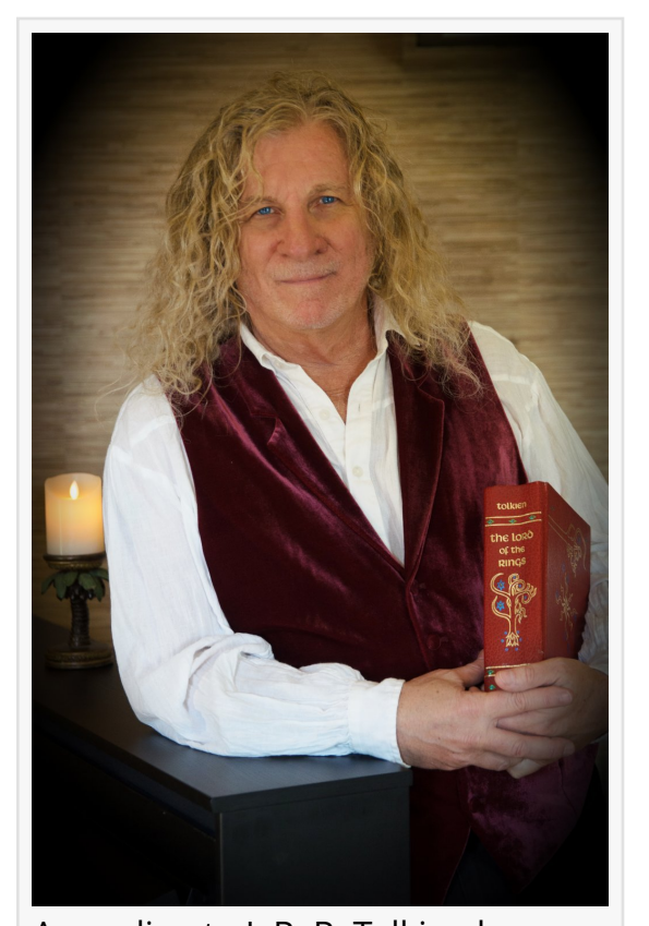
Appealing to J. R. R. Tolkien lovers and cinematic music fans of all ages, the new album is a music interpretation of stories from the #LOTR books; it is available in CD, digital download and streaming formats worldwide.