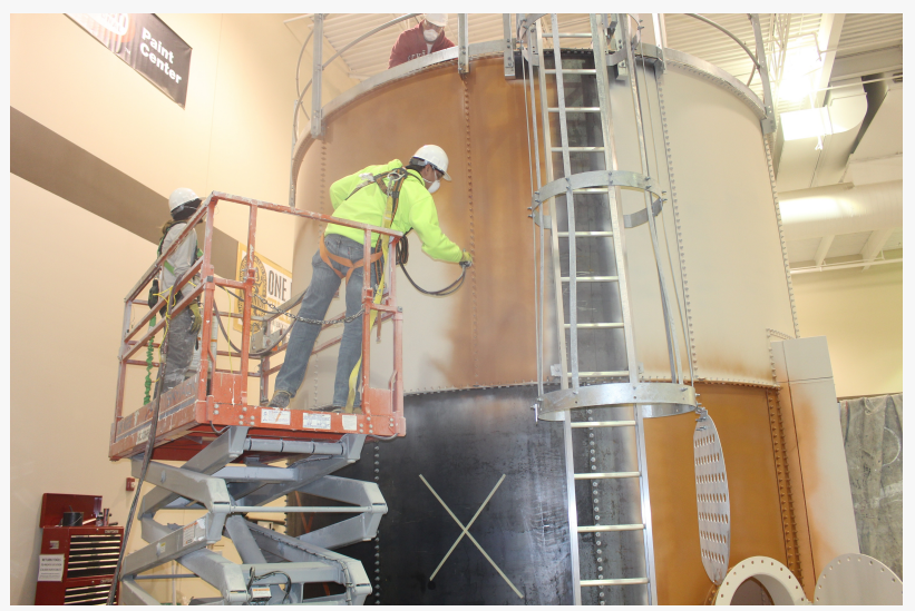
Industrial painting apprentices practice their craft on an industrial tank mock-up at the North Central Illinois Finishing Trades Institute in Aurora, IL.

The Tri-Council Development Fund (TCDF) is a partnership of the Illinois union finishing trades industries. The TCDF utilizes the leadership, advocacy, training, and other resources of more than 9,000 workers and signatory contractors across the state to