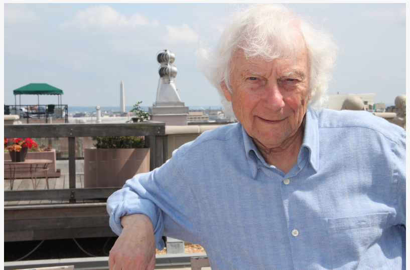
Author Joe Rothstein

and other high tech instruments of warfare. The campaign includes an international telethon to gather a billion names, mostly from those living in nations that deploy such weapons.