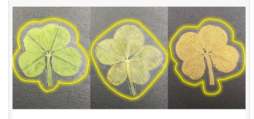
4-Leaf, 5-Leaf, Gold gilded Clovers

This press release can be viewed online at: https://www.einpresswire.com/article/576132909