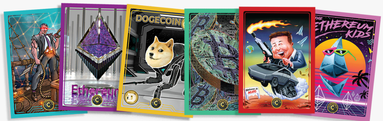
CURRENCY Series 1 Trading Card Set Cards by Industry Leading Artists and Designers

This press release can be viewed online at: https://www.einpresswire.com/article/576142094