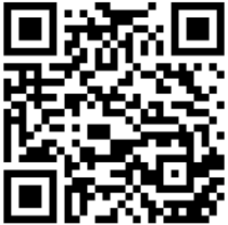
#1 Option for a 1031 Exchange Fund San Diego - QR Code

The IRS is always looking to take your investment proceeds through capital gains tax, but the Tax Advantage 1031 Exchange team helps keep the IRS at bay. Capital Gains tax California investors often have to pay, is a tax that the IRS charges on the sale of an investment property against the profit. This fee can easily be a very hefty loss for any investor. However, with the Tax Advantage 1031 Exchange California Fund in place, investors will be able to reinvest their proceeds from the sale of their investment property into a qualified Commercial Real Estate fund potentially saving millions in losses to the IRS. This allows business owners and investors to move quickly through the reinvestment process,