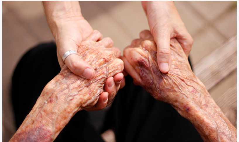
Caregiver holding hands with a senior