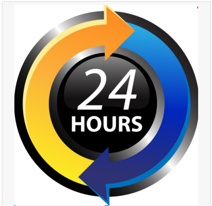
24 hours in a circle