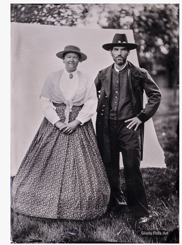
Glens Falls Art tintype of a couple

This press release can be viewed online at: https://www.einpresswire.com/article/576394027 EIN Presswire's priority is source transparency. We do not allow opaque clients, and our editors try to be careful about weeding out false and misleading content. As a user, if you see something we have missed, please do bring it to our attention. Your help is welcome. EIN Presswire,