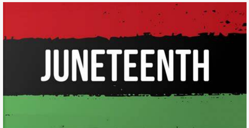
Juneteenth Celebration of Freedom