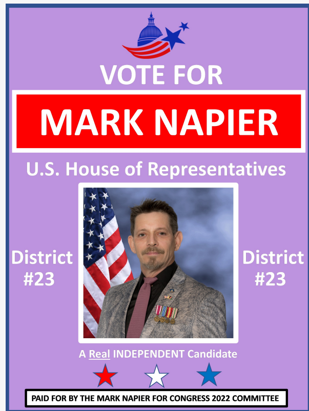
Independent Candidate for District 23