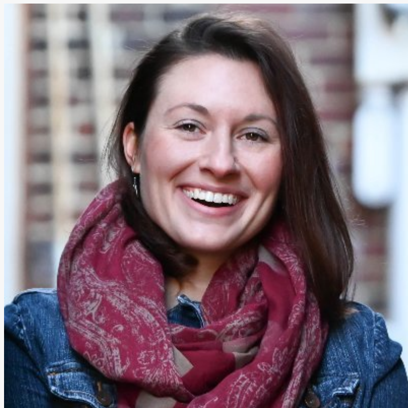
Author/Illustrator Ashley Belote

This press release can be viewed online at: https://www.einpresswire.com/article/576493856