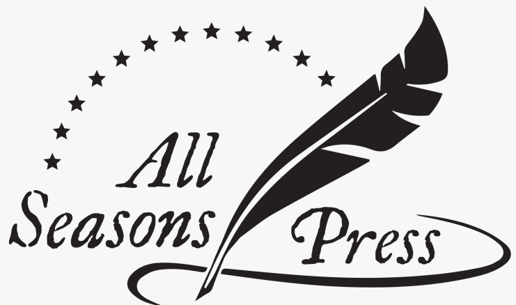
All Seasons logo

According to Bookscan data, "The Bodies of Others" should have been #6 on the New York