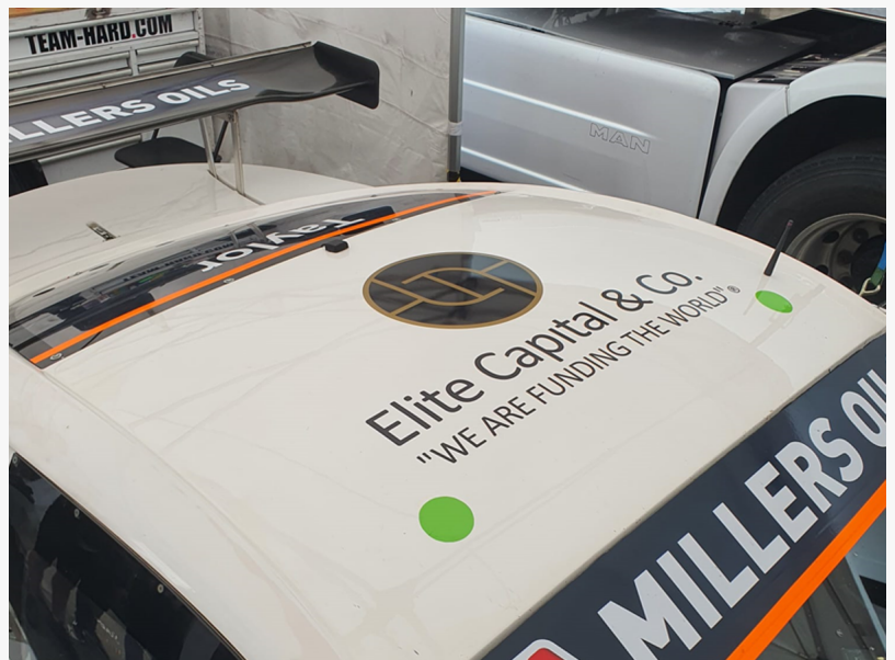
Elite Capital & Co.'s Sponsored Car Wins Second Place in the Ginetta GT4 Race at BTCC on Sunday 12 June 2022

This press release can be viewed online at: https://www.einpresswire.com/article/576611930