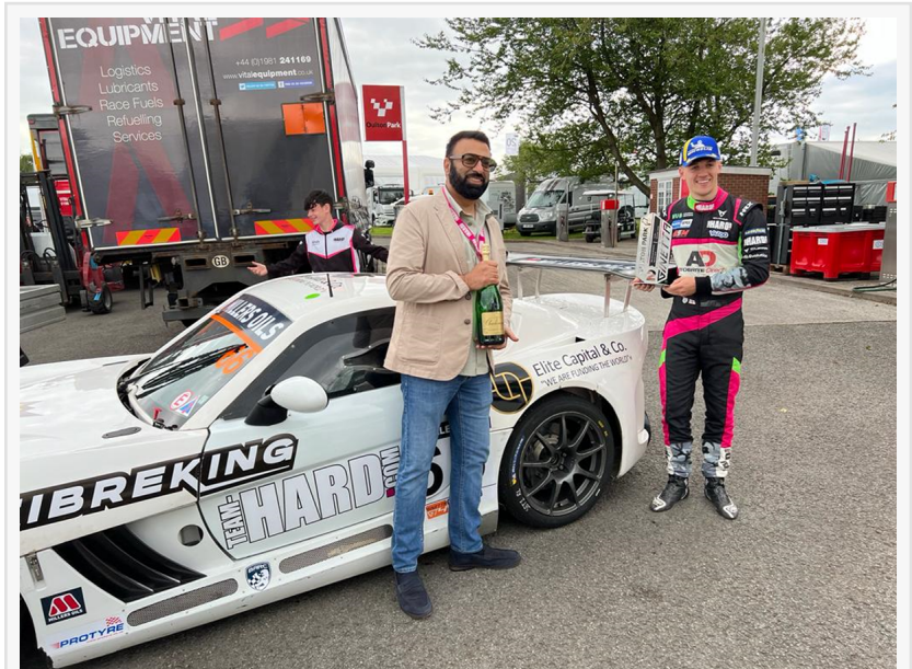
Elite Capital & Co.'s Sponsored Car Wins Second Place in the Ginetta GT4 Race at BTCC on Sunday 12 June 2022