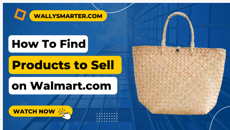
Software Tools for Walmart Sellers

This press release can be viewed online at: https://www.einpresswire.com/article/576664870