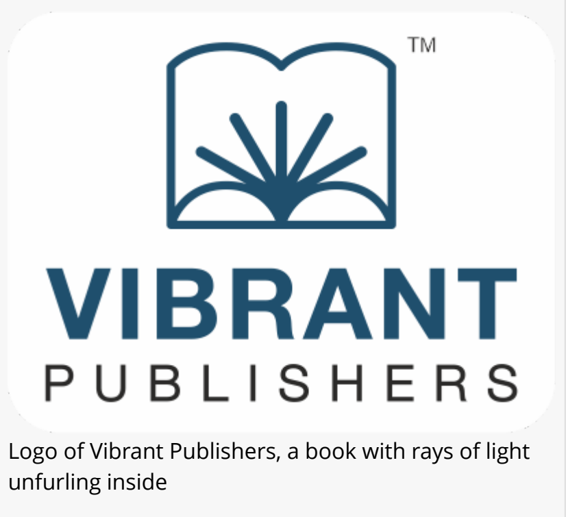
Logo of Vibrant Publishers, a book with rays of light unfurling inside